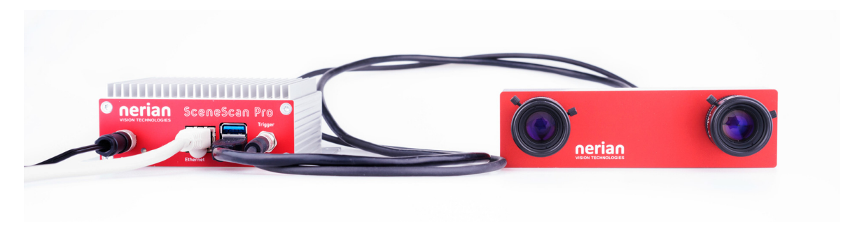
Figure 3: Karmin3 connected to SceneScan Pro.

The trigger signal must provide an appropriate trigger frequency that can be matched by the cameras and the selected SceneScan model. The possible frequencies for different system configurations are listed in Table 3. In low-light situations the desired frame rate might not be achieved if the sensor exposure time is too high. In these cases, an appropriate exposure time upper limit should be configured in the SceneScan settings.