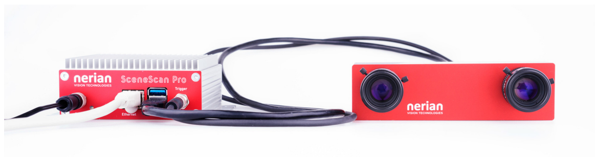
Figure 3: Karmin3 connected to SceneScan Pro.

The trigger signal must provide an appropriate trigger frequency that can be matched by the cameras and the selected SceneScan model. The possible frequencies for different system configurations are listed in Table 3. In low-light situations the desired frame rate might not be achieved if the sensor exposure time is too high. In these cases, an appropriate exposure time upper limit should be configured in the SceneScan settings.