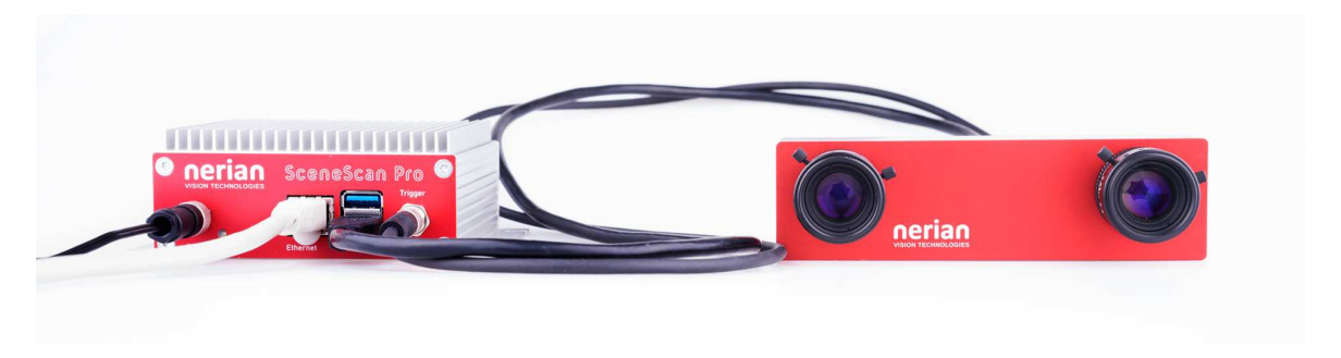
Figure 3: Karmin2 connected to SceneScan pro.